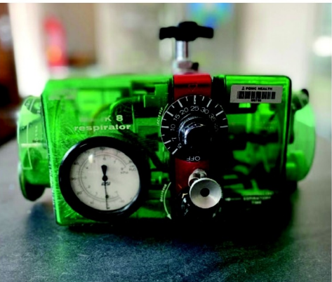
An existing mechanical respirator being reverse-engineered to be used as an emergency ventilator.