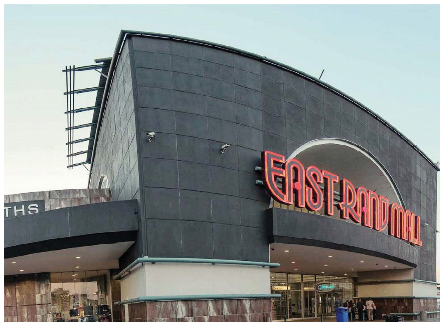
Vukile, owner of the East Rand Mall, is finalising the acquisition of the 25 000m 2 Alameda retail park in Granada, Spain.

Rapp said the big story in the six months to September was the growth in Vukile's off-shore exposure to 24 per cent of its R20.4bn total property asset base and the deployment of in excess of R2bn worth of equity into growing the Spanish business and the further investment of R407.5m into Atlantic Leaf, its strategic entry into the UK market, that increased its shareholding in the company to 35 percent.