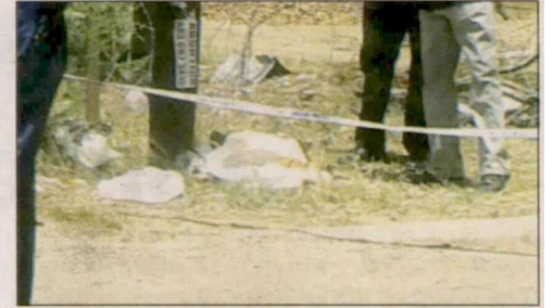
The scene at the corner of Carney and Short Streets in Mahikeng CBD where two foetuses were found on Wednesday morning.

when the forensic personnel took the bodies out one by one from the plastic bags they had been wrapped in. The pale skin with full heads of hair, still dripping with blood and amniotic fluid showed that they had been aborted in the early hours of the morning. According to eye witnesses the discovery was made earlier in the morning by a man who reported it to the police. On arrival the police had to wait for the forensics before clearing the scene.